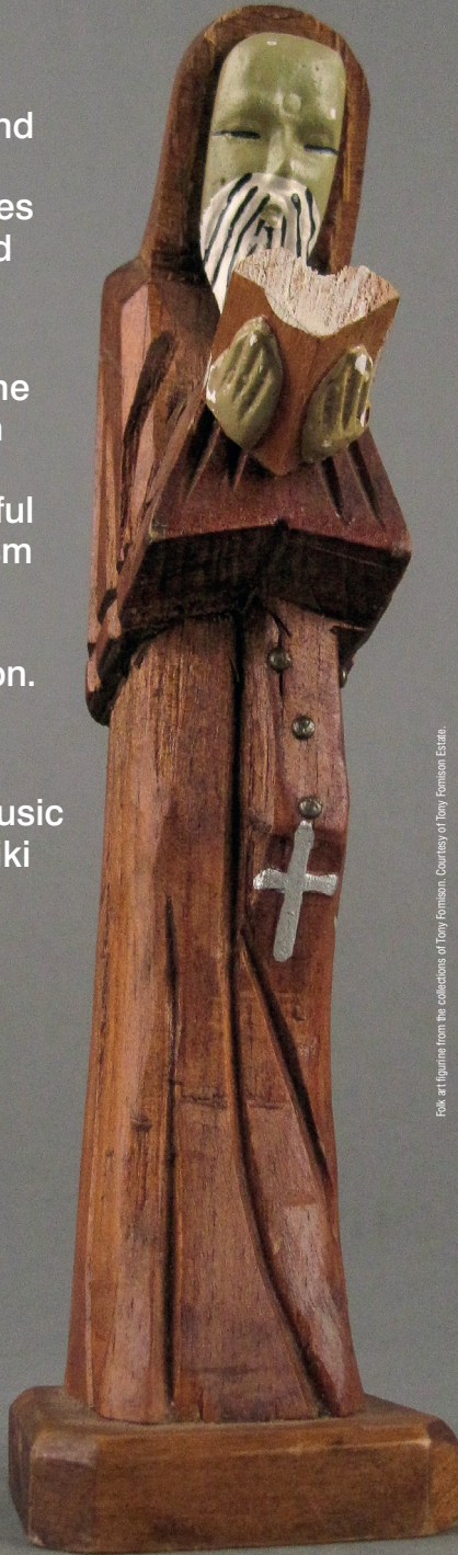
Folk art figure from the collections of Tony Fomison.

Winter events include a diverse range of talks, music and family Matariki celebrations.