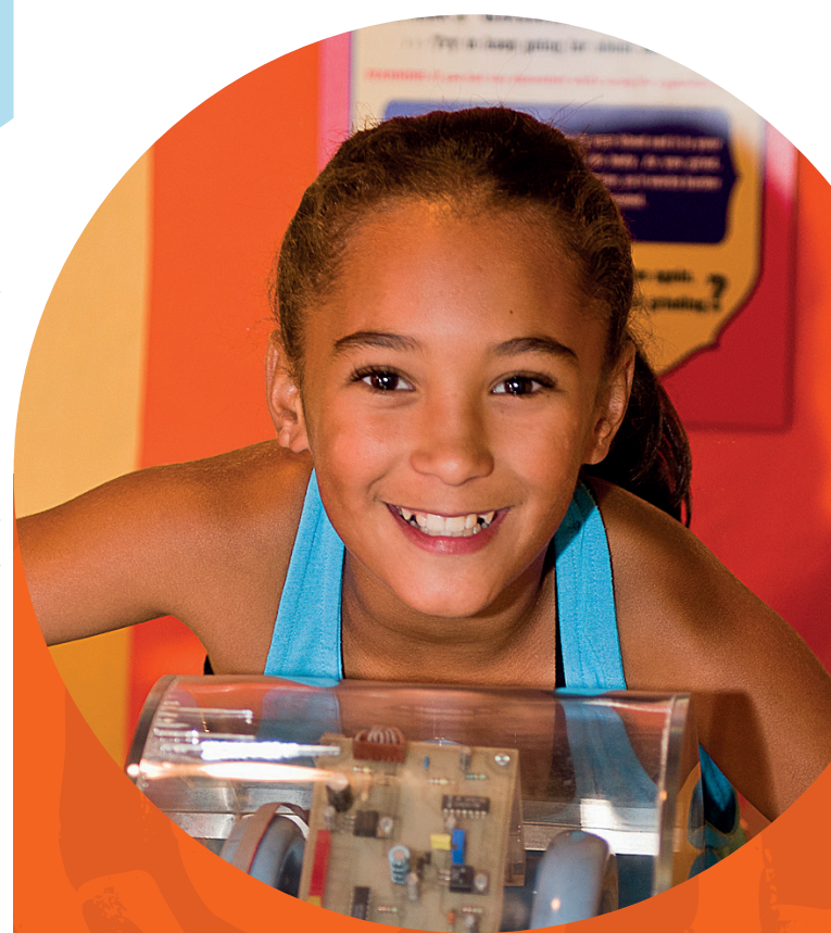
Front cover image courtesy of Te Manawa Museum of Art, Science and History, Palmerston North