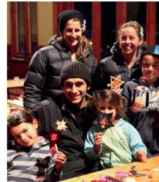
Matariki Whānau Night at Rotorua Museum 2013.