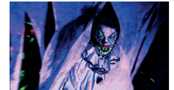
Nightmare at the museum, Rotorua Museum, 2013.

After a three year break we are waking the dead! Are you brave enough to take the horror walk? Age 13+, ID required. In conjunction with Wildside Promotions this return to Nightmare promises to be better than ever. Dates: Friday 5 and Saturday 6 August 2016 • from 6.30pm Cost: $15, on sale from 4 July 2016. Bookings essential!