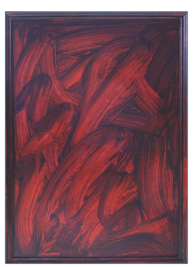
Untitled by Gilmore Wall

In art, even though we cannot touch the work we can imagine how the texture feels with our eyes.