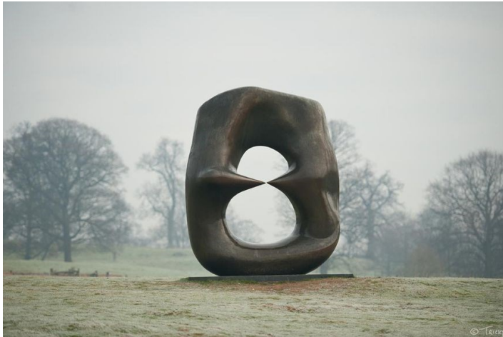
Henry Moore , Oval with Points, 1968.

When artists make an artwork they have to think carefully not only about the objects in their work but the negative spaces as well.